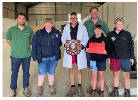
1st Gillingham & Shaftesbury YFC