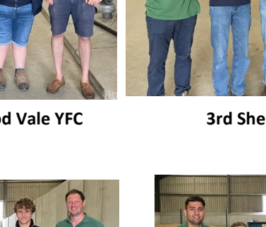
3rd Sherborne YFC