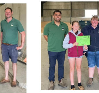
3rd Puddletown YFC A Team