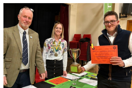
Askerswell Cup for Good Citizenship Gillingham & Shaftesbury YFC