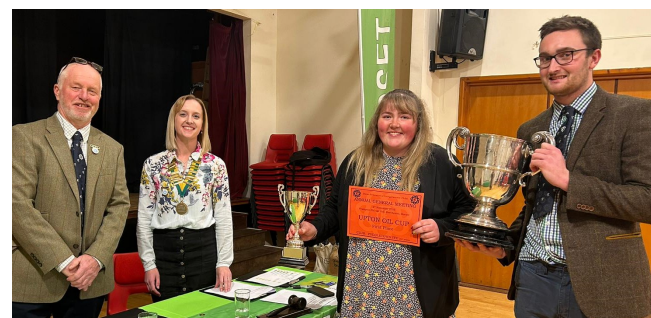
Upton Oil Cup Puddletown YFC with 407 points