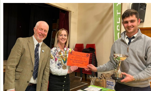
Brig Hoblyn Cup for Recruitment Sherborne YFC 34 New Members