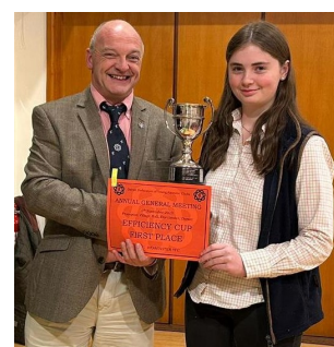
Efficiency Cup Beaminster YFC